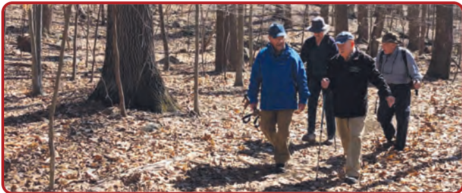
Resident Hikers on our "yellow" trail