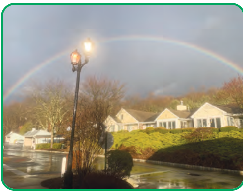
May you find lots 'o' gold at the end of your rainbow!