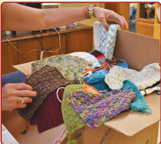
Residents preparing a shipment of knitted fabric squares for donation to Online Angels Charity