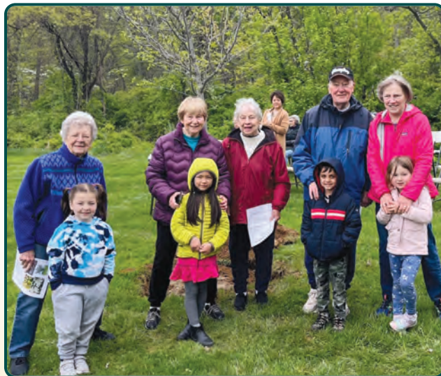
Residents with their Friendship Center pen pals.